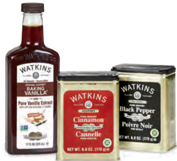
GOURMET pages 3-16

All of the above Points of Superiority make up THE WATKINS WAY, and you will agree that it is a good way.