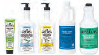
REMEDIES by J.R. Watkins pages 17-23